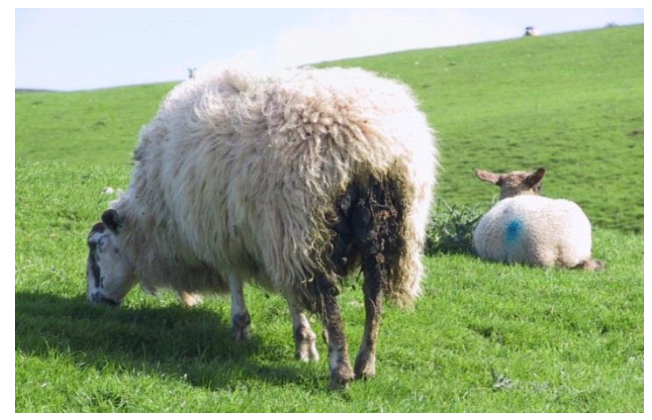
Lamb faecal worm egg counts can be used to help determine whether dosing is required, particularly if clean pasture is not available post-weaning.

For example, a proportion of the strongest lambs (perhaps around 10 per cent) could be left untreated, or the lambs allowed to graze the contaminated paddock for several days after treatment before moving to safe grazing (unless a persistent anthelmintic is used), in line with SCOPS guidelines.